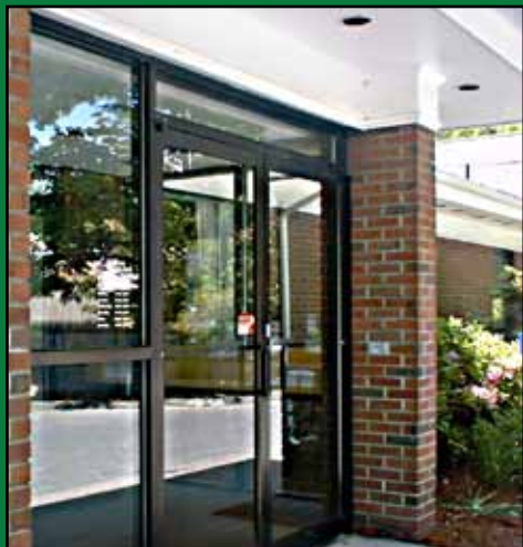
Flexible installation options