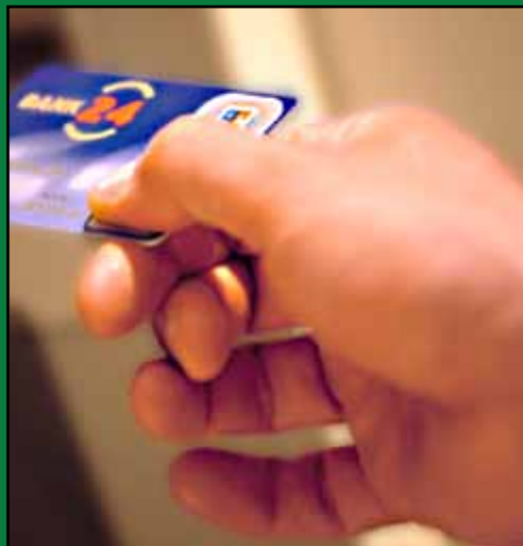
Twenty-four hour vestibule access control